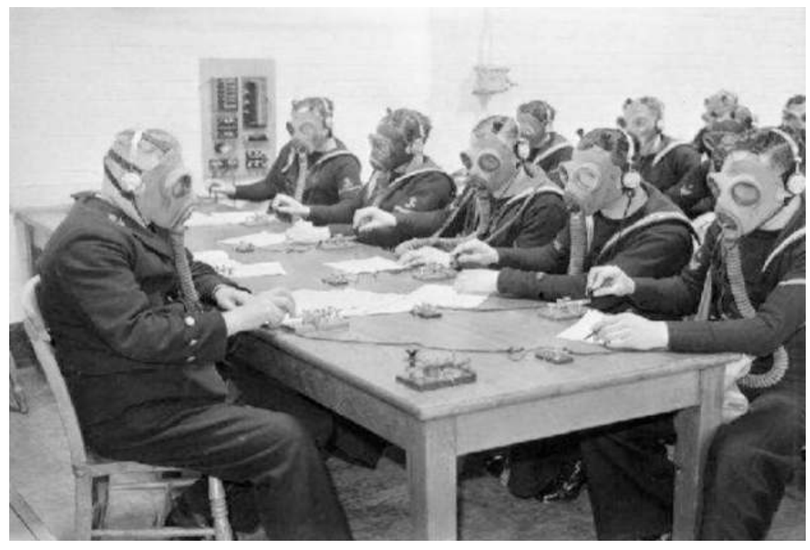
DON'T COMPLAIN ABOUT WEARING A MASK