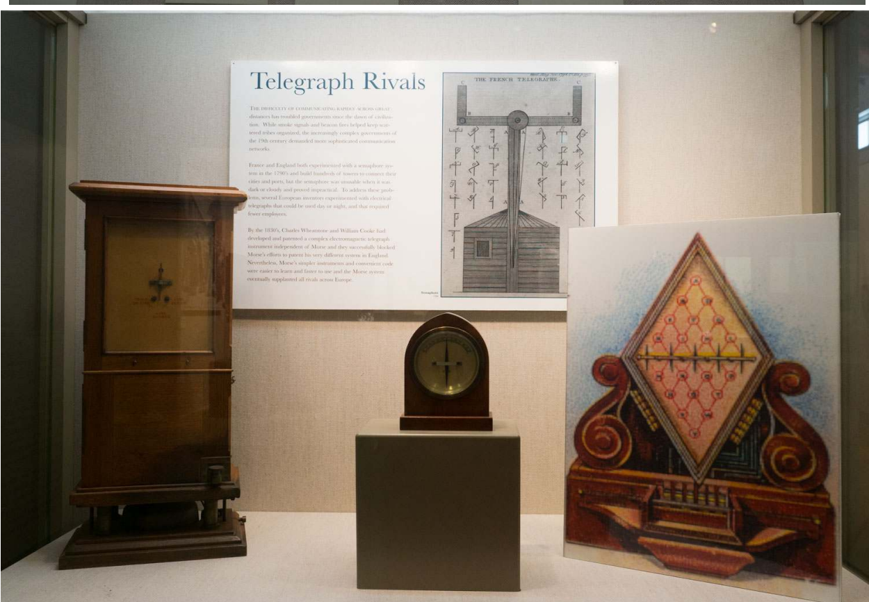
Thanks to Howard AE3T for this Article, part 2 to follow