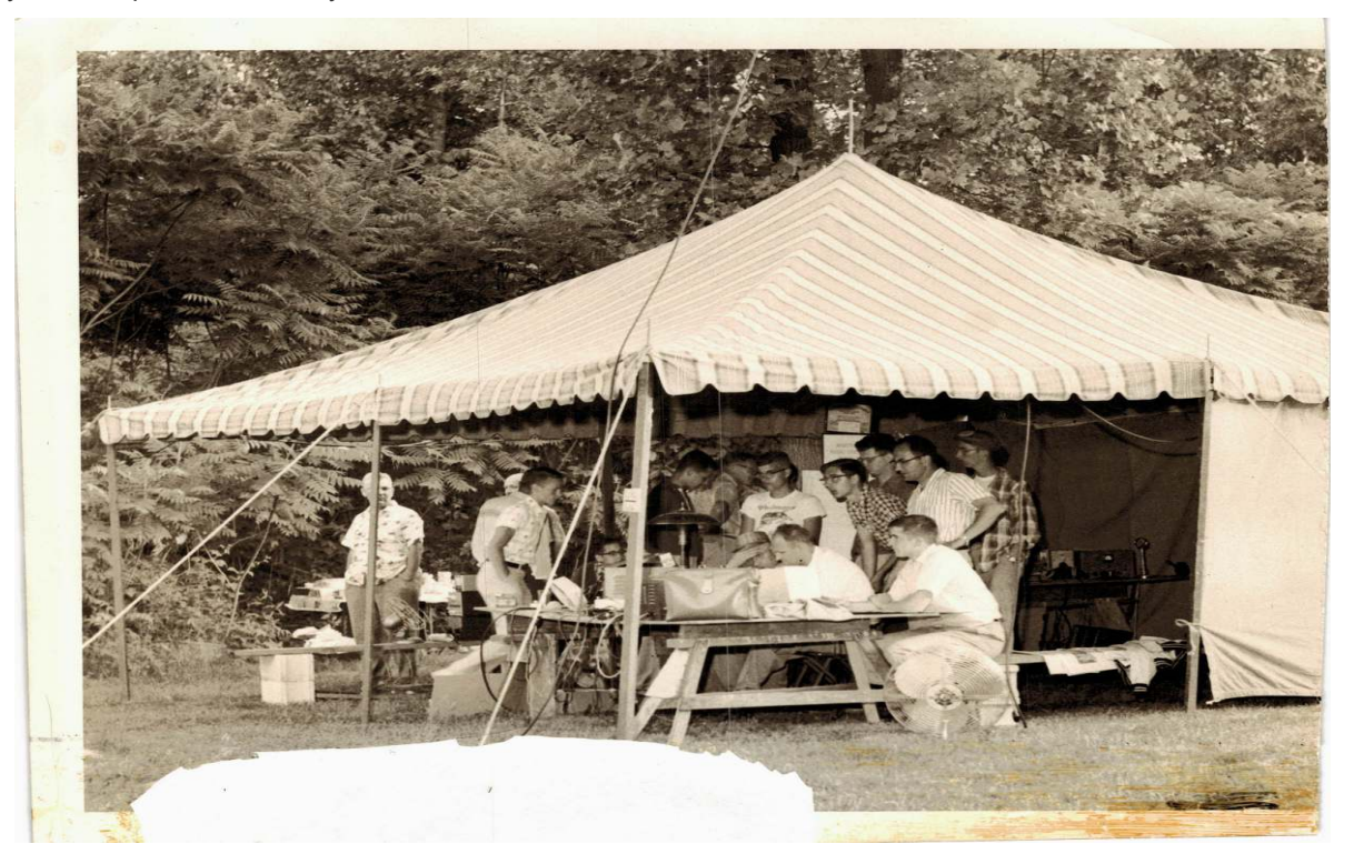
Field Day 1958

To encourage new hams, in 1975, DLARC decided to donate an ARRL Handbook to the Easton Area Public Library. In the last year of the decade, DLARC moved into another new service area – providing communications for non-profit and charity events. The first event was the 100 mile Lehigh Valley Wheelmen Gap Galop Century. This type of service activity would expand dramatically in the next decades.