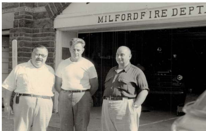
1955 flood: Unidentified operators in front of Milford emergency headquarters.