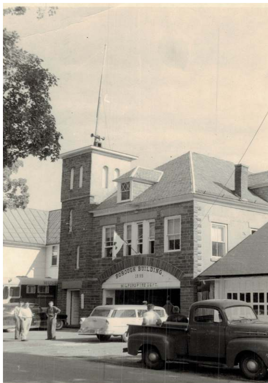
1955 Flood Radio Headquarters: The building where club members worked during the flood aftermath.

August 2020 marks the 65 th anniversary of Hurricane Diane which drowned the Delaware Valley. Easton resident remember that it destroyed the Free Bridge over the Delaware River and flooded the town. DLARC members were very active in emergency communications during the crisis.