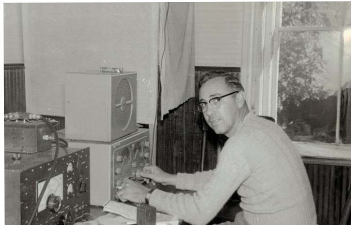
1955 flood Milford: Unidentified club member manning the station at Milford.