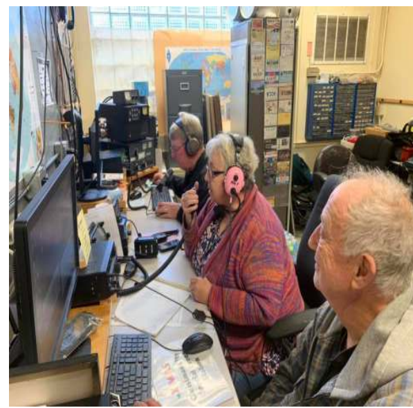
WX3MAS #! 1969