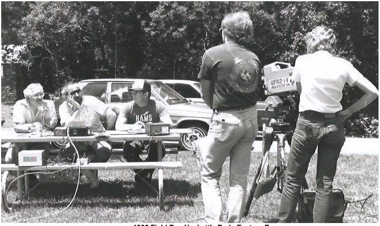
1986 Field Day Hackett's Park, Easton, Pa.