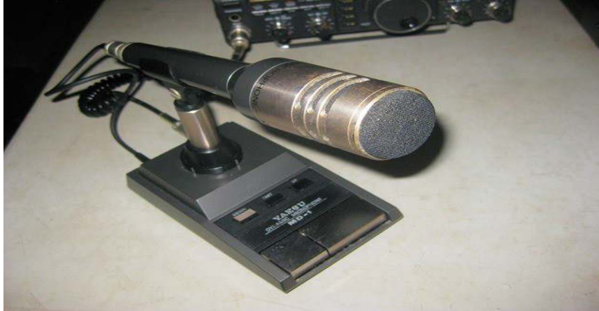
Yaesu MD-1 Desk Microphone

http://www.radiomanual.info/schemi/ACC_microphone/Yaesu_MD-1_user.pdf