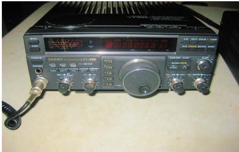
Yaesu FT-890 Transceiver with built-in Automatic Tuner 160 through 10 meters, 100 watts