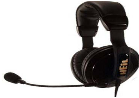
Heil Proset earphones with HC-5 element boom mike