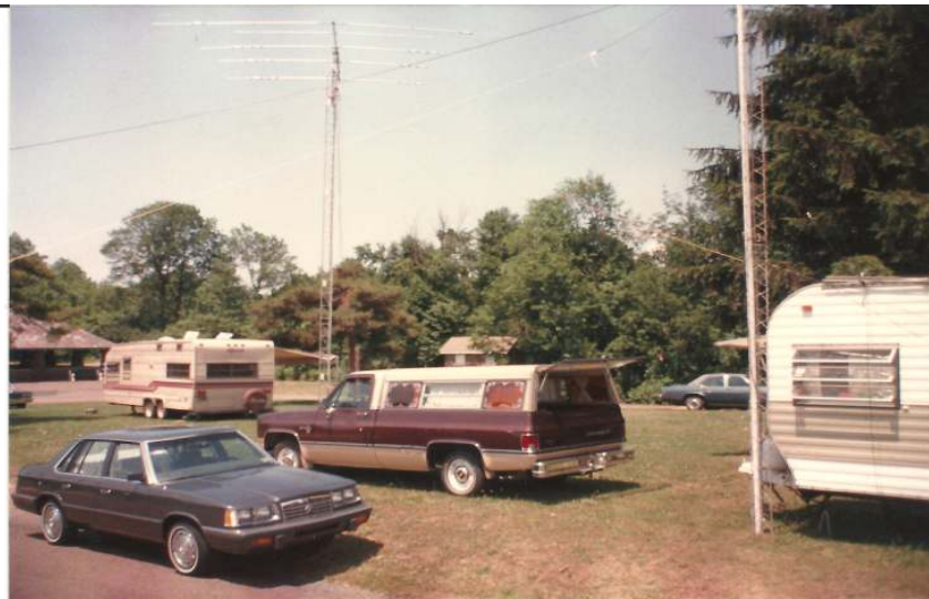
Field Day at Hacketts Park, Easton, Pa.