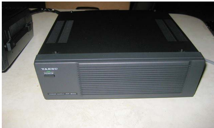
Yaesu FP-800 20 Amp Matching Power Supply

http://www.qsl.net/sm7vhs/radio/yaesu/ft890/specs.htm