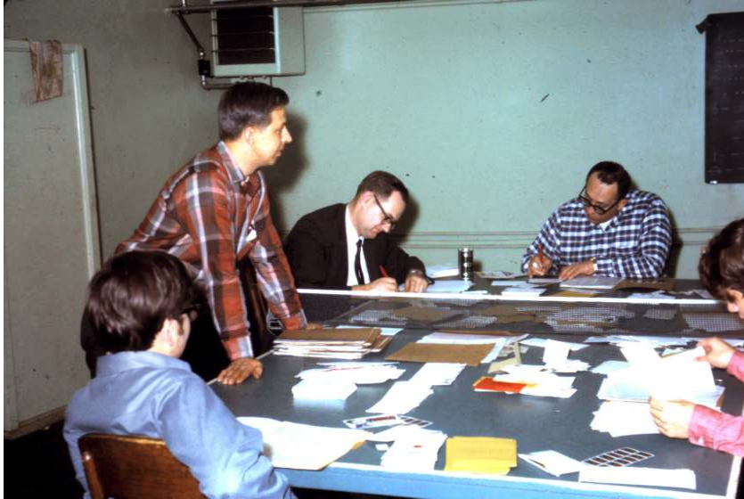
WX3MAS – 1969 – Filling out QSO Cards