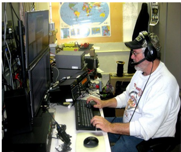
Jay / N3OW on 10 meters