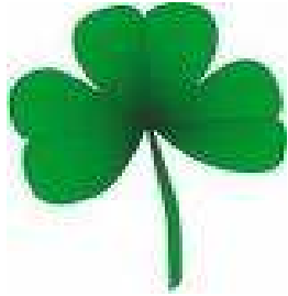
½ tsp thyme