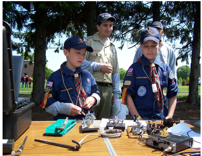
de AL / W3CE